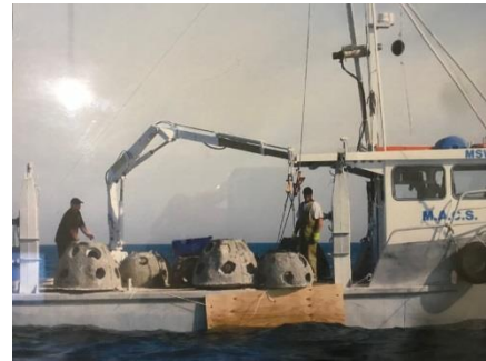
Reef building in Port Phillip Bay