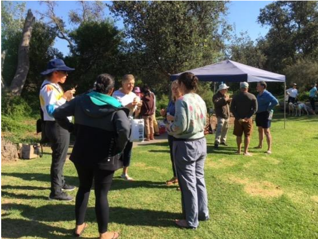
Various members at the sunny March 2022 BBQ