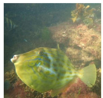
Photos from a snorkel at Teahouse Reef this season