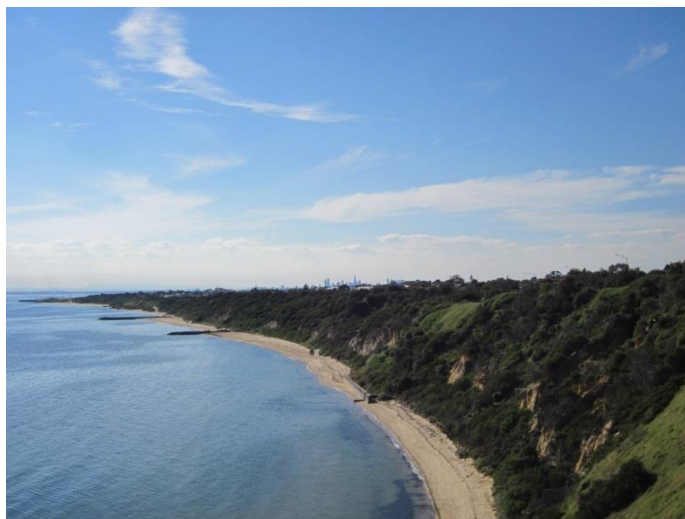
Bayside foreshore on a sunny afternoon