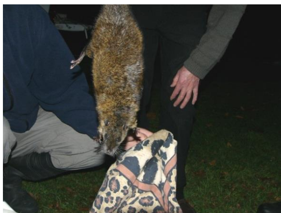
A large female Rakali