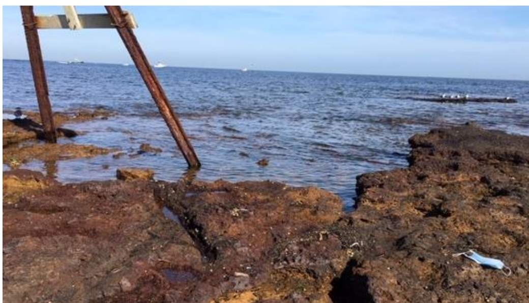
This reusable face mask on the right was seen at South Triangle Reef during Stage 3 lockdown. Masks are essential, but if you can obtain proper reusable washable cloth face masks, they are much better for the environment.

Has anyone else got any information about foxes at Ricketts Point that they'd like to pass on?