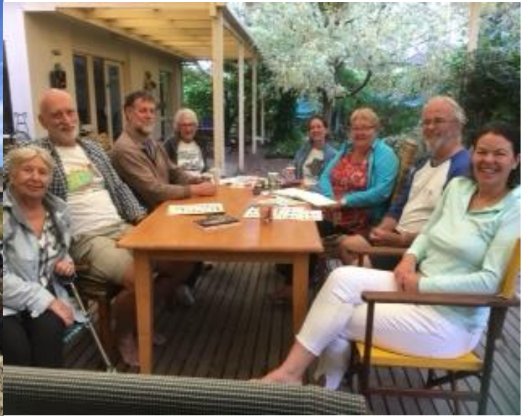
Members at the inaugural Mt Martha Great Victorian Fish Count

We continued to make a conscious effort in 2019 to increase our activity and experience in monitoring and surveying the biodiversity within the sanctuary. This is a central role of our organisation, and we hope to continue to invest in this important work.