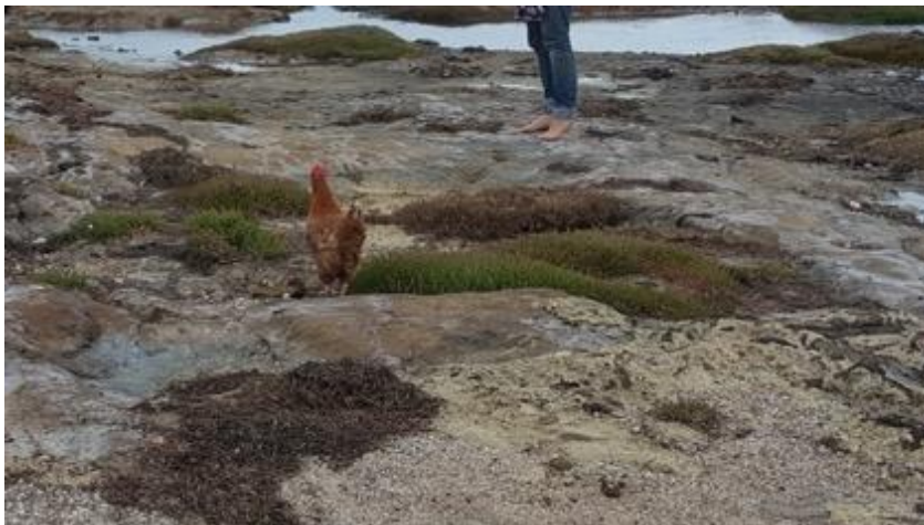
Chicken Little (perhaps a new member) on a Ricketts Point stroll

In addition, we were lucky to receive small grants from Coastcare and Parks Victoria to help us with equipment for our 3193 Ricketts Point Beach Patrol and our rock pool rambles and beach rambles, both very popular events with the public.