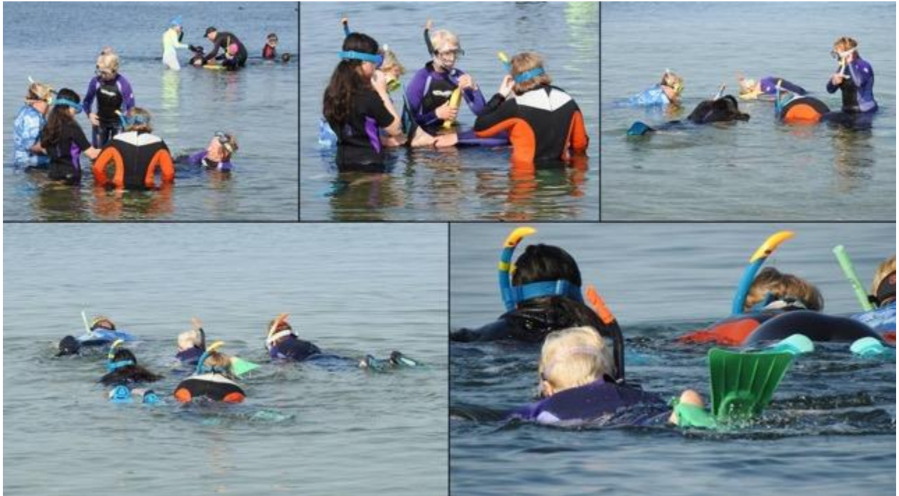
And they're off and swimming like fish!