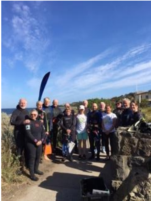
Great Victorian Fish Count, December 2019