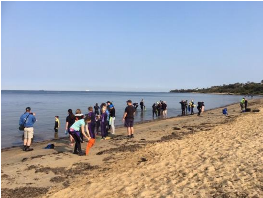
Beginner snorkellers from Summer by the Sea Jan 2020 getting ready for their first snorkel