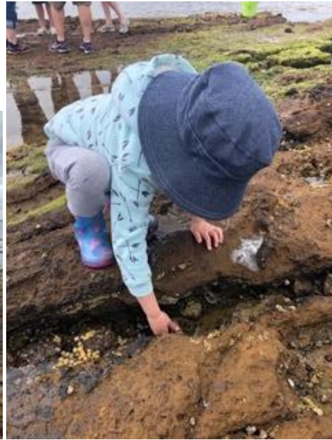
"Rock Pool Ramble" and "Little Girl Exploring", Summer by the Sea Rock Pool Ramble, Jan 2020