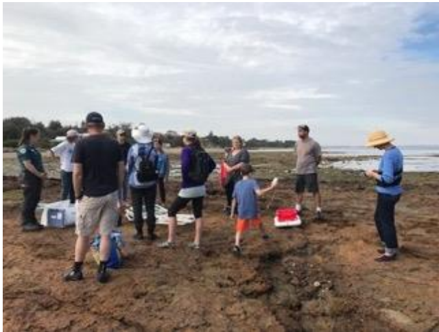
Intertidal Sea Search, July 2019

summer sea search with Parks Vic was cancelled due to high winds – which did not put off the kite-surfers